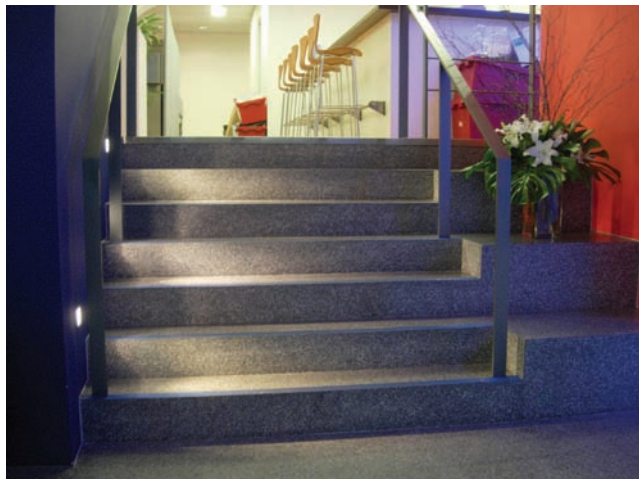
Resin Terrazzo - commercial