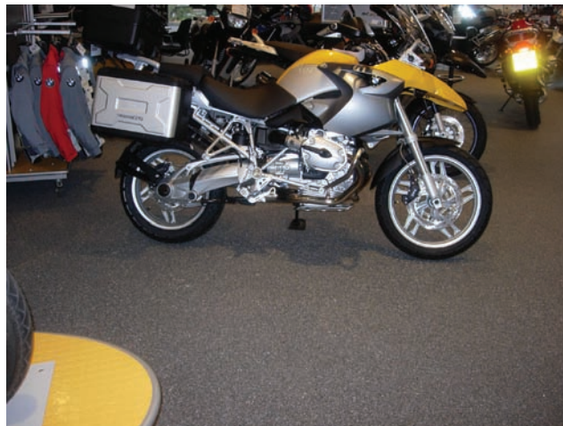
Multiquartz - motorbike showroom