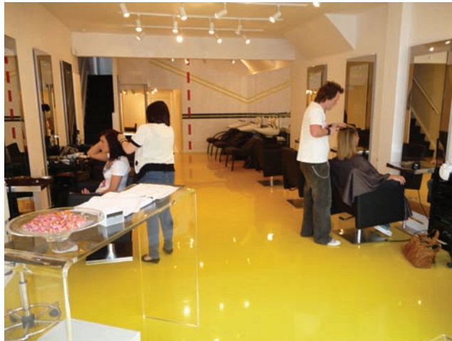
Multiquartz Flow - hair salon