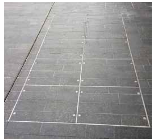
Barrel lifting points

SAFE LIFTING AID RECOMMENDED See Cover Skate pages 52-53