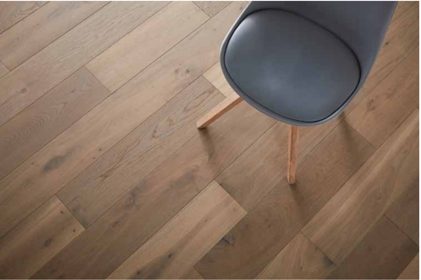
Above 600100 Ness Smoked Oak