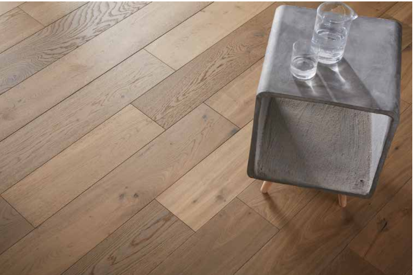
Above 600100 Ness Smoked Oak