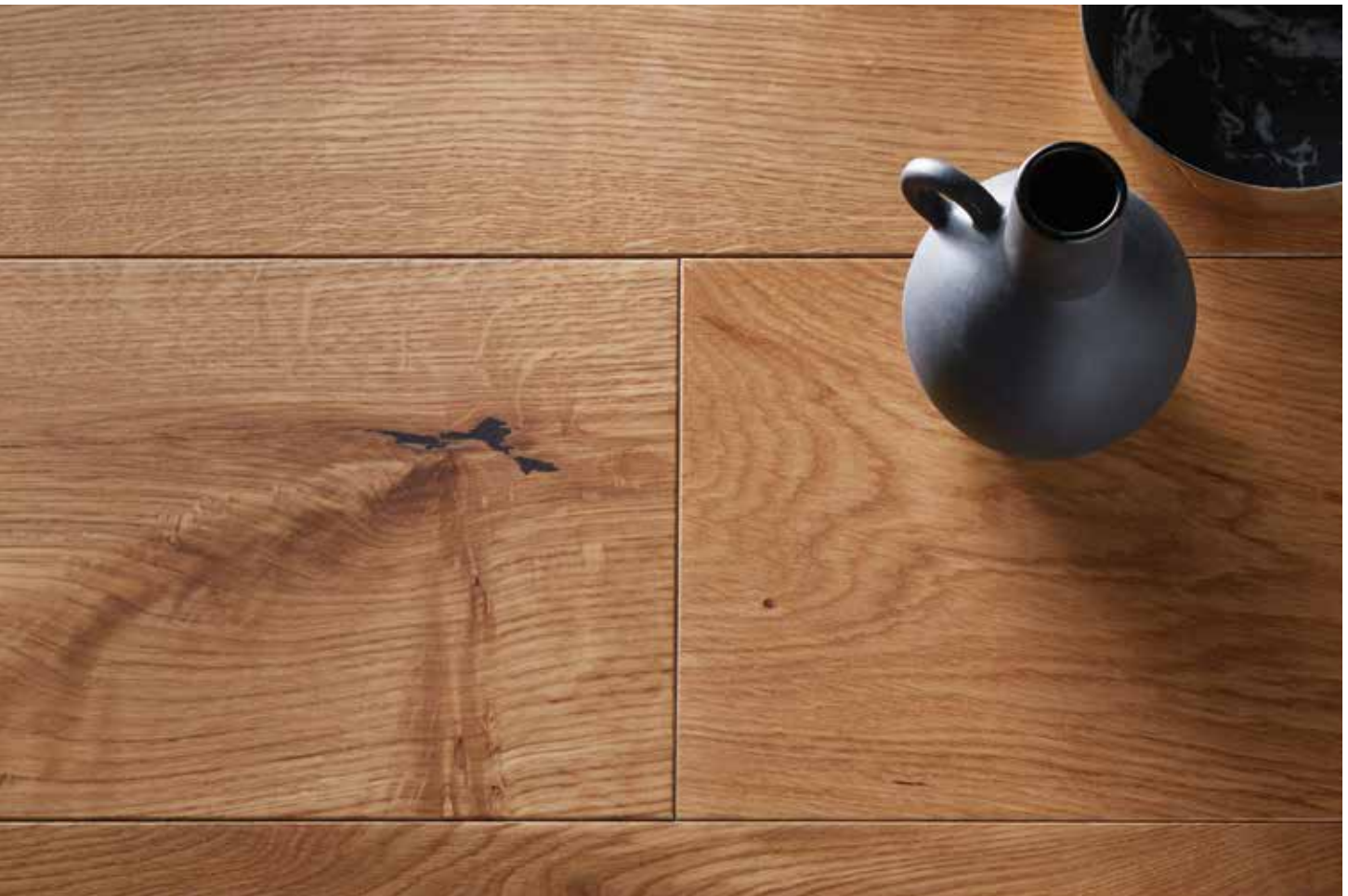
Above 700350 Almond Oak