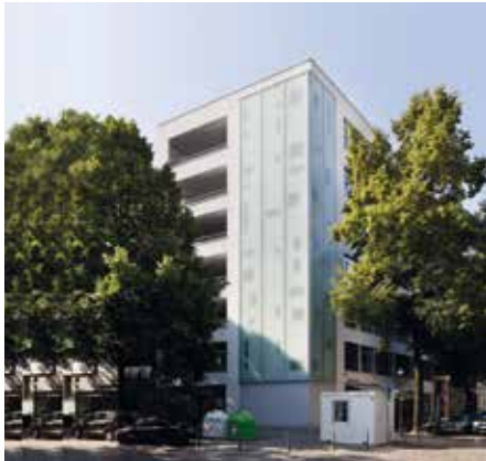
CarLoft® GmbH, Berlin, Germany