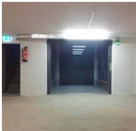
Dorfstrasse, Winterthur - Zürich, Switzerland