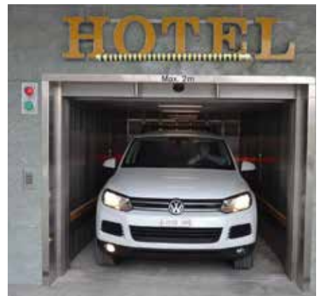
Garage Swissotel - Zürich, Switzerland