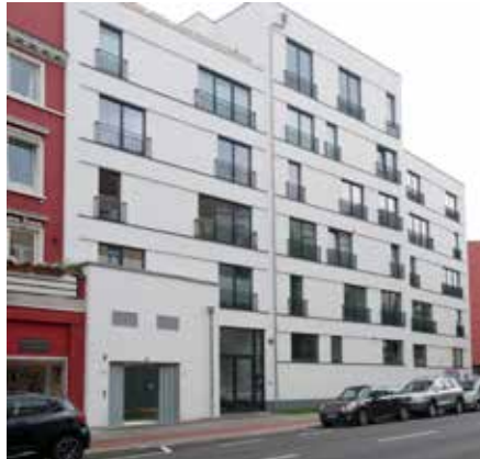
Müggenkampstrasse - Hamburg, Germany