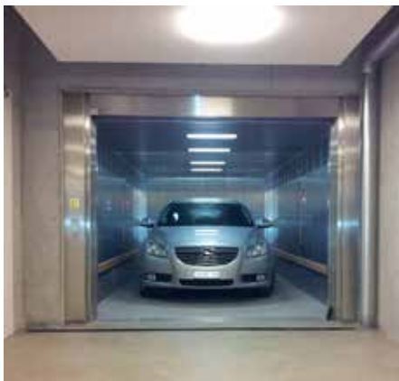
Parking - Zürich, Switzerland