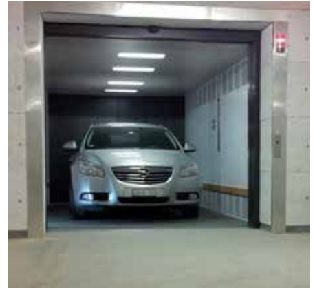
Wildbachstrasse - Zürich, Switzerland