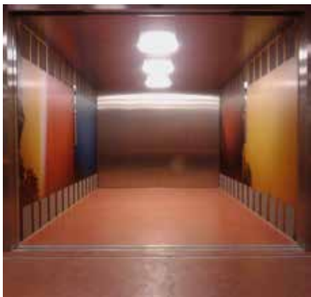
Münchhaldeneck - Zürich, Switzerland