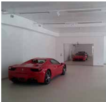
Garage Zenith SA - Sion, Switzerland