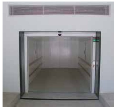
Bollerweg - Wädenswil, Switzerland