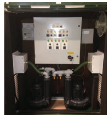
This image is for illustrative purposes only, actual product may vary.

The kiosk is fitted with an alarm beacon as standard and can be provided with telemetry for remote plant monitoring. Other innovative features include thermostatic cut off controls and air filter monitoring to extend blower life.