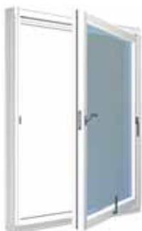
Cleaning position, interior view