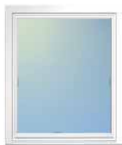
Closed position, exterior view standard timber