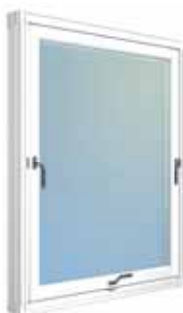
Closed position, interior view