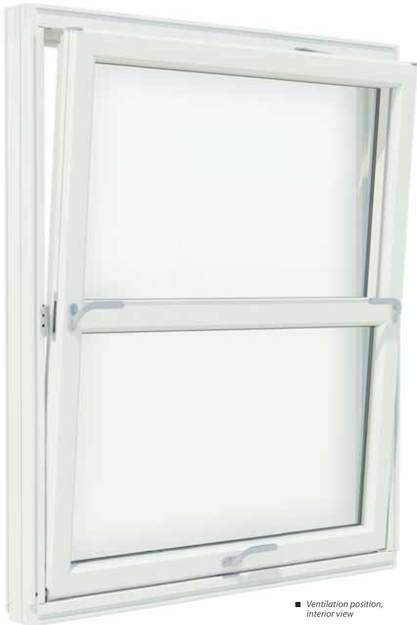
■ Ventilation position, interior view