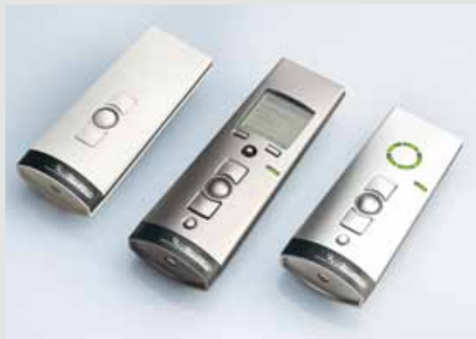
Remote controls Silent Gliss 9940