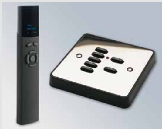
Remote controls Silent Gliss 0450

Our Customer Services team will be on hand from the start to offer expert advice on the most appropriate systems, control combinations and wiring for your project.