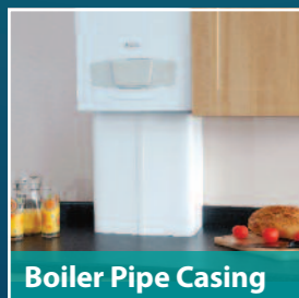
Boiler Pipe Casing