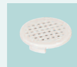
20mm Vent Plug