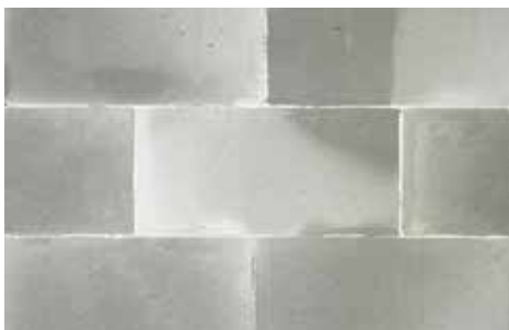
K Mix Thin Bed Mortar