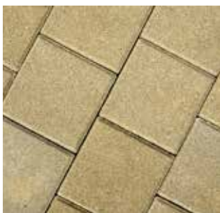
K Mix Paving Grout