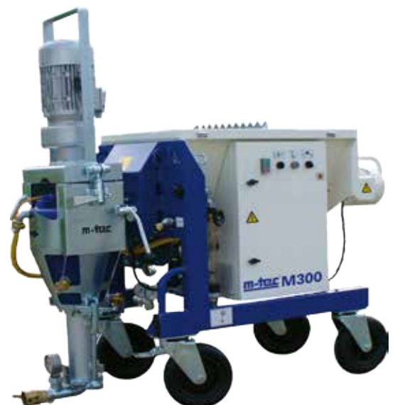
m-tec M300 spray machine