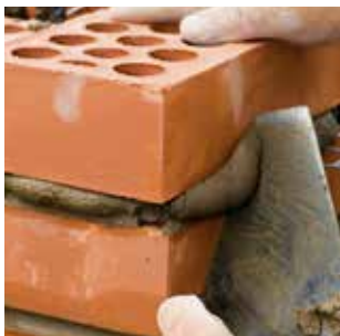
K Mix GP Mortar Coloured