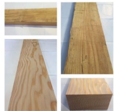
Douglas Fir Softwood Gate