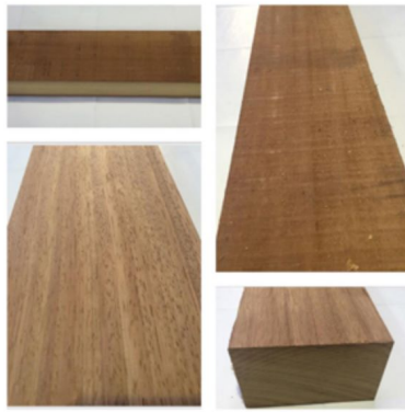
Iroko Hardwood Gate