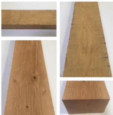
European Oak Hardwood Gate