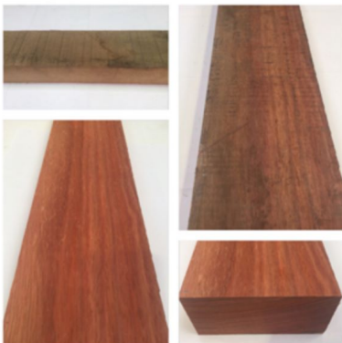
Padauk Hardwood gate