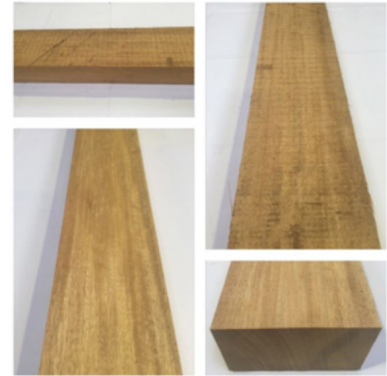
Movingui Hardwood Gate