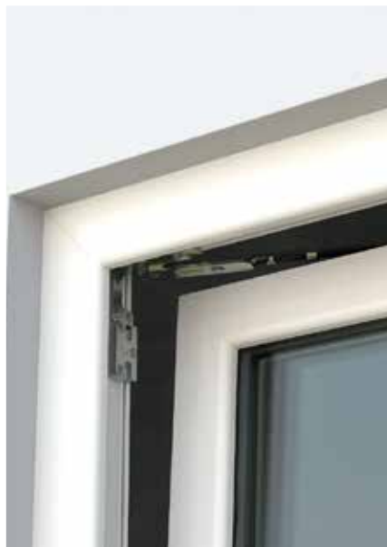
Tilt function for safe and secure ventilation without having the sash fully open.