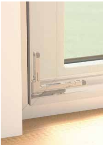
Concealed Hinges for a more modern flush and sleek design.

For all Material Types: MACO Juliet Balcony doors can be manufactured in Aluminium, Timber and PVCu