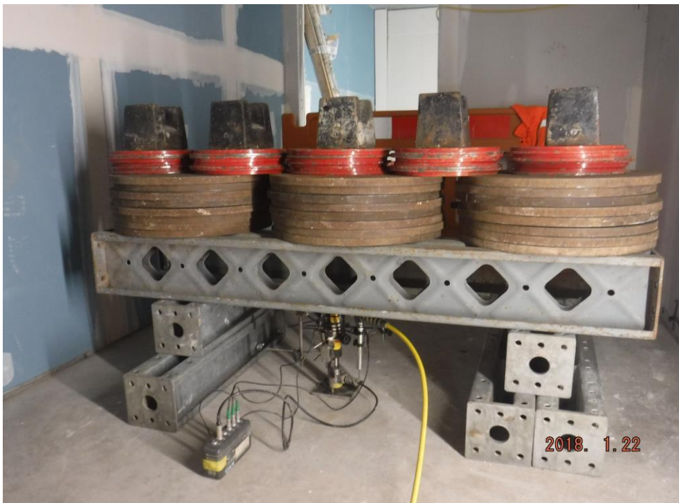
Photographic Record 2 - showing load frame, kentledge and load application apparatus