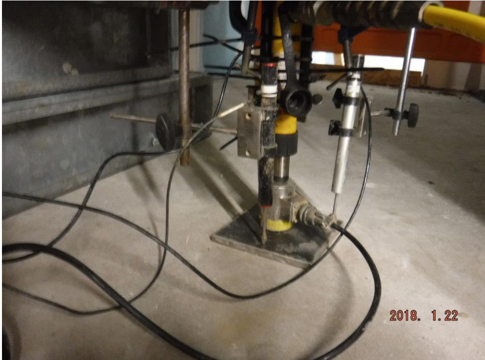
Photographic Record 3 - showing load apparatus assembly