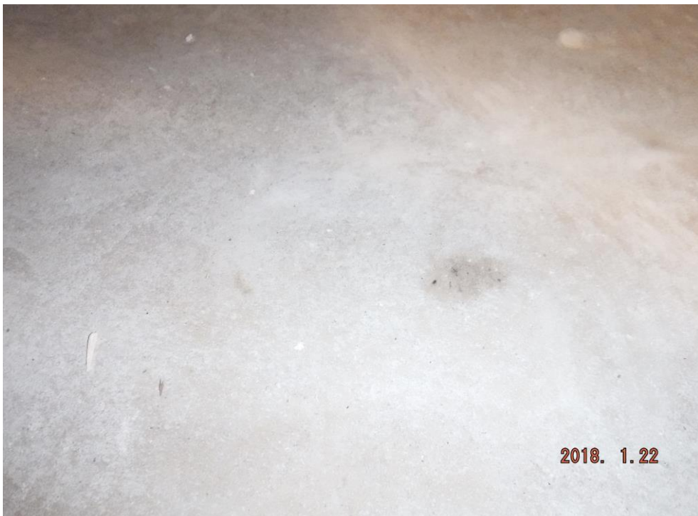
Photographic Record 4 - Showing Retanol Extreme Fine Concrete Material after testing. No visible sign of distress is evident