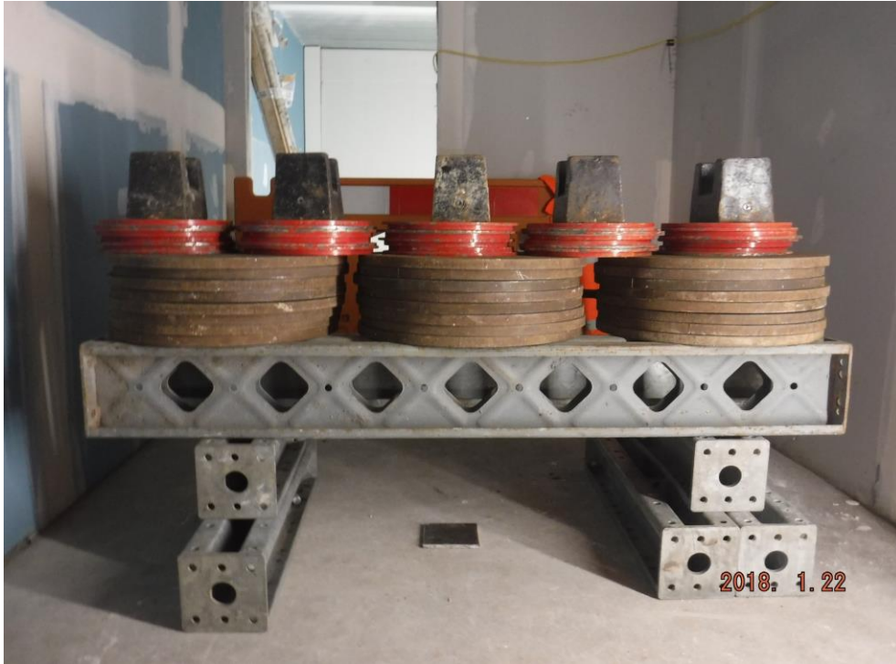
Photographic Record 1 - showing load frame and kentledge